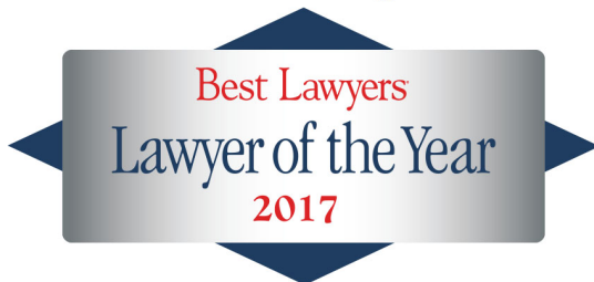
Family Law – Tulsa, OK